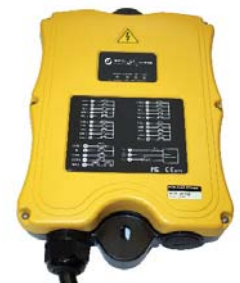
FLEX EX 8/12 RECEIVER

For more information, contact Magnetek Material Handling or your local Magnetek Sales Representative.