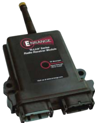
CAN-6 Receiver shown