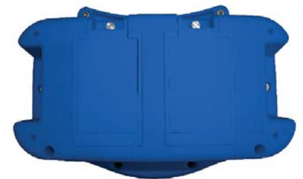
Battery pack access